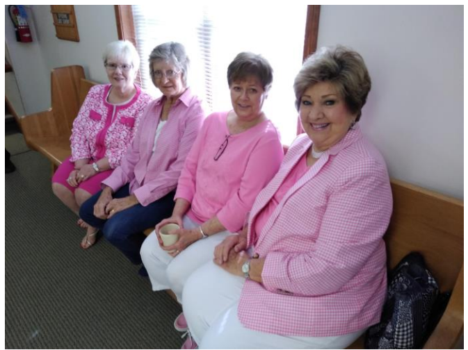
Pretty ladies in pink!