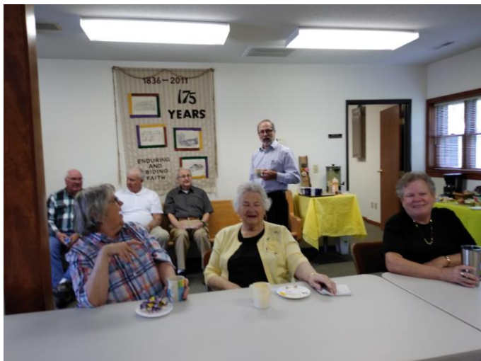
All of us didn't get the pink memo!