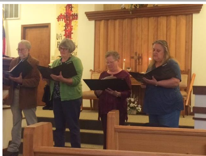
We are so blessed to have our JOY choir – 4 voices that sound like 40!