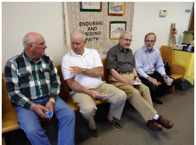
Some of us are more serious than others