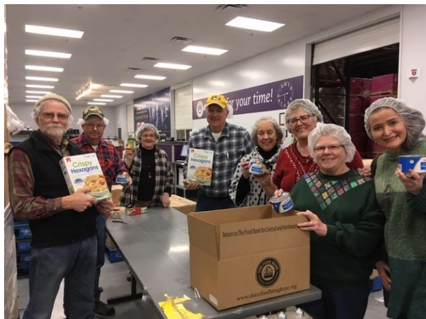
We had an awesome time while doing good work at The Central Missouri Bank!

This month, we are putting together our annual church report for 2018. It seems odd to go back and look at the old year when the new one begs for our attention. And yet, sometimes, taking stock of the previous year can help us move forward with greater clarity. It's that way in our personal lives, too. During the cold, winter months when we tend hibernate indoors, we might consider gathering up the threads of the past year on a page, a notebook, a journal. We might grieve again over a loss, but we might also find warmth in the joys that almost got away in "real time" when we were too busy to notice and give thanks.